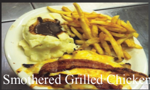
Smothered Grilled Chicken