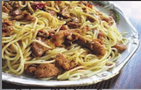
Cajun Chicken Pasta