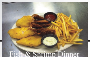
Fish & Shrimp Dinner